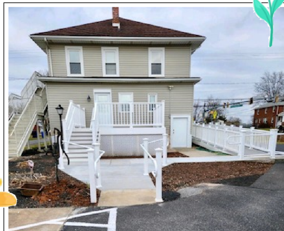
Taneytown History Museum back deck and walkway/ramp renovation 2024

Many of us are discussing how to attract a younger audience to the museum and we wonder "Are kids really interested in history?" Earlier today, February 24th, a few of us from the Museum Committee and the THMA Board participated in the Celebrating America History Expo at Westminster High School. At the Expo there were hundreds of kids involved with a great many history projects. Many of the students were very enthusiastic to talk