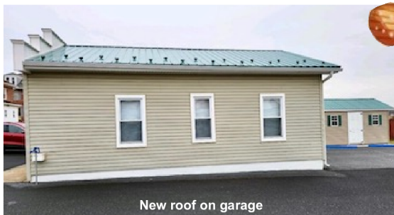
New roof on garage