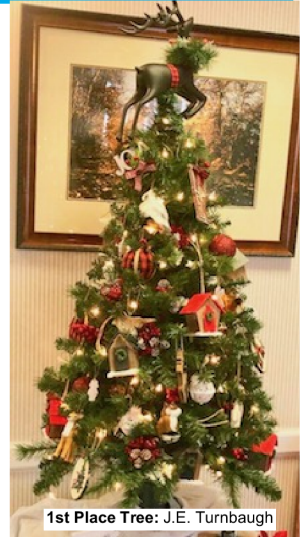
1st Place Tree: J.E. Turnbaugh