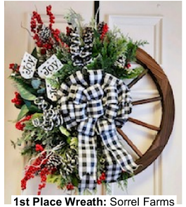
1st Place Wreath: Sorrel Farms