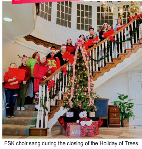
FSK choir sang during the closing of the Holiday of Trees.