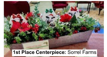
1st Place Centerpiece: Sorrel Farms