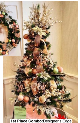
1st Place Combo: Designer's Edge