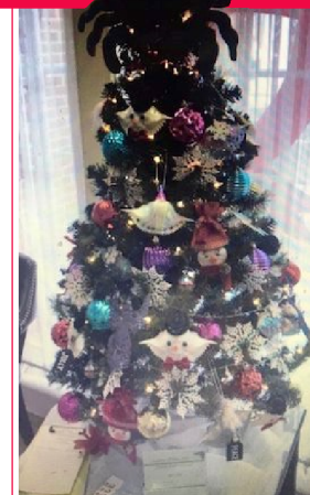
Trees: 1st - Crabby Scott's Seafood