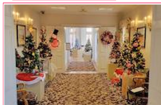
Entrance to Holiday of Trees inside the bank

This year we celebrated the 15th successful year of The Holiday of Trees, Wreaths & Centerpieces. It was wonderful to hold this event this year after missing 2020 due to the COVID-19 pandemic. This year we had 23 entries with 10 trees, 2 centerpieces, 7 wreaths & 4 combo's.