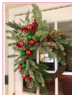
Trees: 1st - Crabby Scott's Seafood