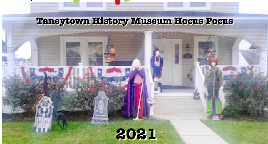
Taneytown History Museum Hocus Pocus