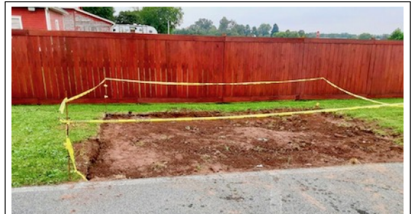
Preparations for the new storage building are underway behind the museum. Thanks to Carroll Hahn for all his work.