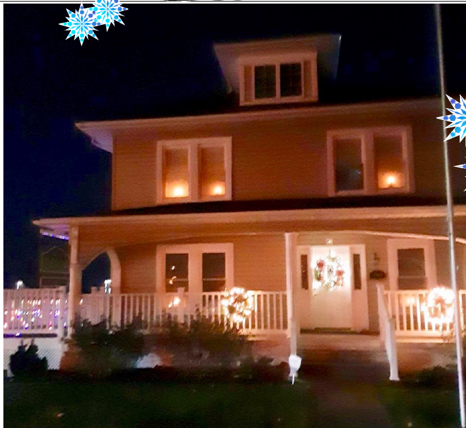
The Taneytown History Museum decorated for the holidays with window candles and lighted wreaths