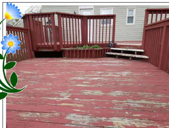
Deck in need of repairs