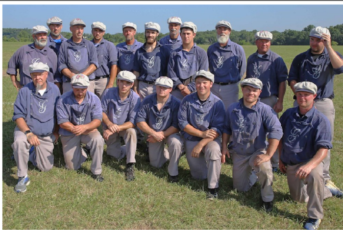
Gettysburg Generals 19th Century Baseball team (at left)