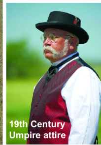
19th Century Umpire attire