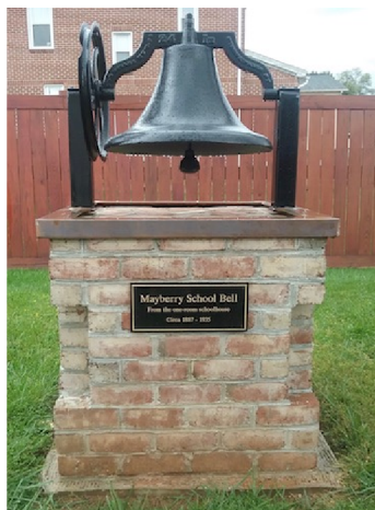
Mayberry School Bell From the one-room schoolhouse Class 1887 - 1935