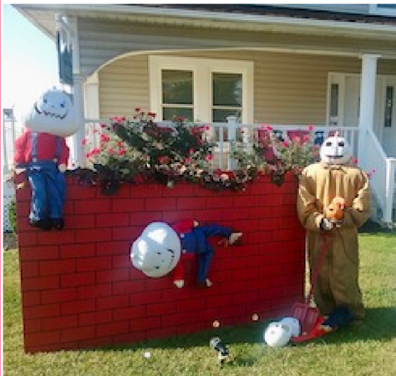
Pumpty Dumpty sat on a wall Pumpty Dumpty had a great fall All the king's horses...