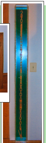
Chain carved from 1 piece of wood