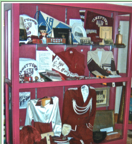
Taneytown High School Exhibit

Thank you to our many faithful volunteers!