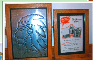
Rod & Gun Club Exhibit