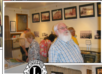
Taneytown Lions Club visits museum