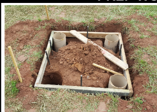
The hole has been dug in the museum front yard and footers poured for the bell.